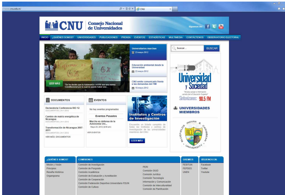
Screenshot CNU 4 website