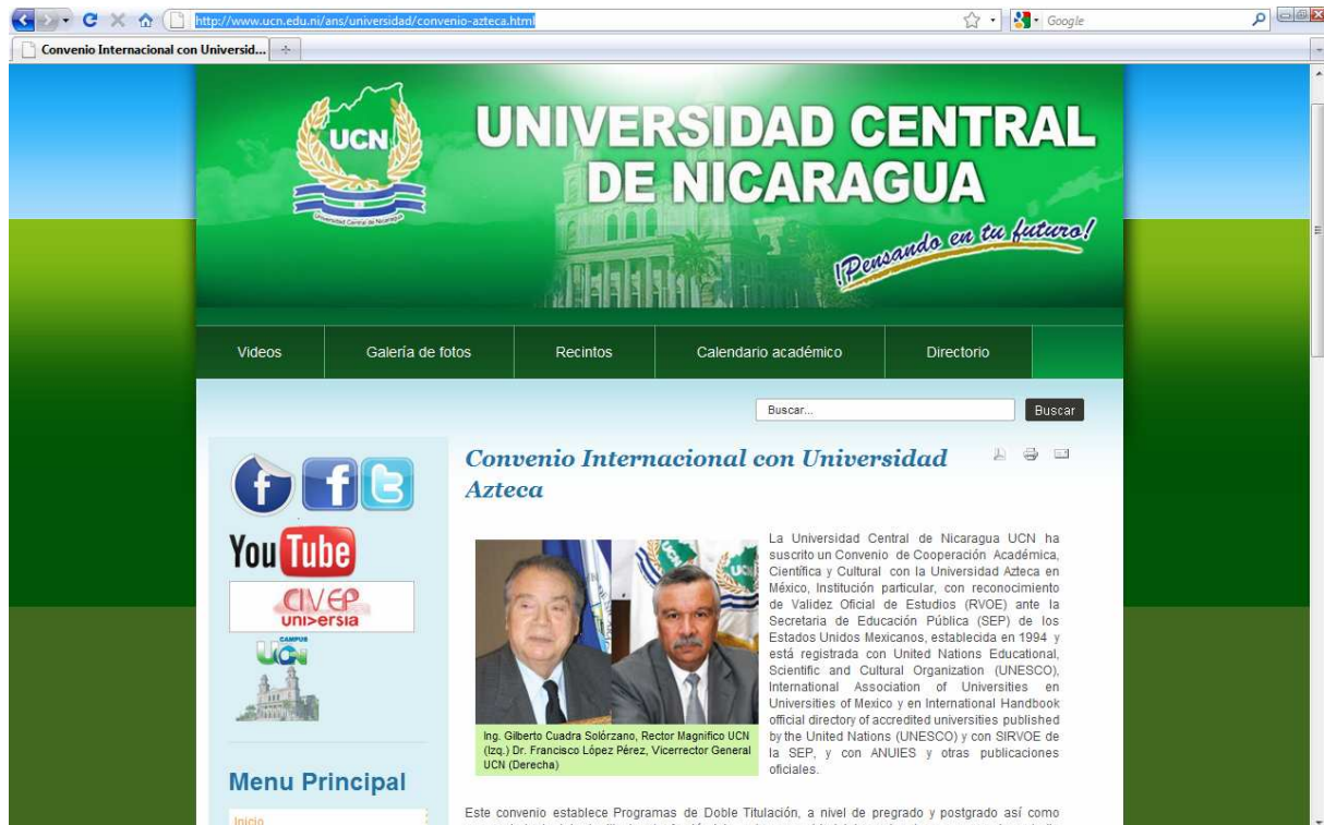
Screenshot of UCN website on collaboration with Universidad Azteca 2