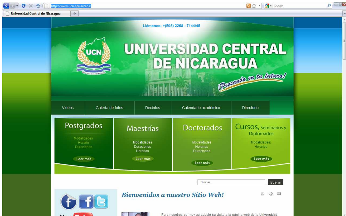
Screenshot of UCN website 1