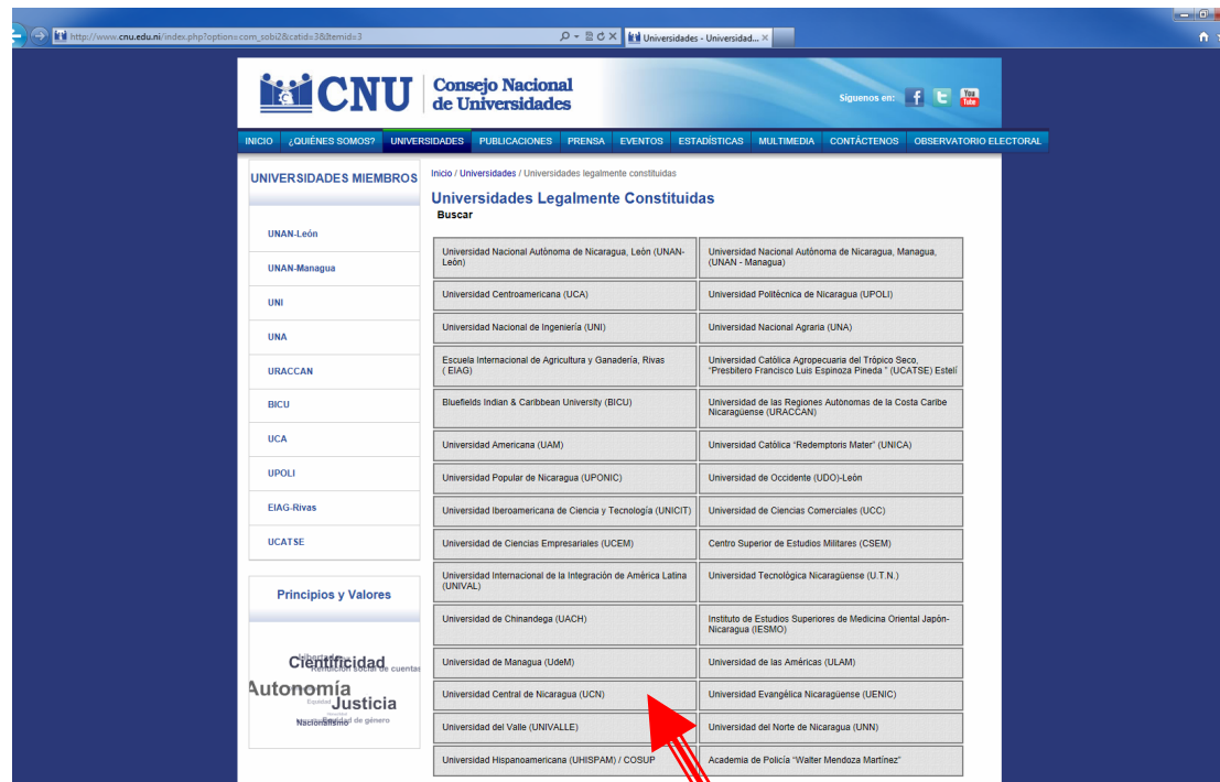
Abb. 6: Screenshot CNU 5 website „Universidades“ with UCN-Listing